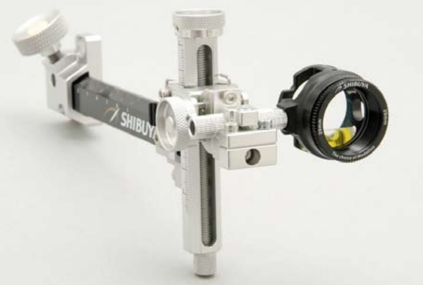
Shibuya 29mm Scope mounted on an Ultima CP 365-6 sight

At last, Shibuya introduces the perfect companion for its highly successful Ultima CP sight: The Shibuya 29mm Scope.