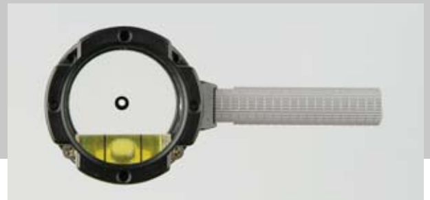
Shibuya 29mm Scope comes equipped with Nikon Archery Target Scope Lens, yellow level and dot kit. (Shown with Ultima CP Rod Holder - available separately)

For the Scope's lens, Shibuya turned to a well-known and trusted optics manufacturer: Fellow Japanese maker Nikon devoted its resources to developing a tough,