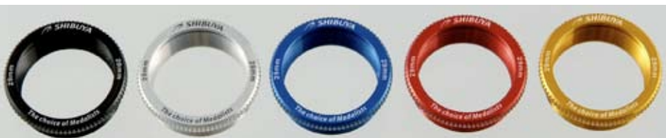
Aluminum Lens Retainer available in 5 colors (Black, Silver, Blue, Red, Gold)

The Shibuya 29mm Scope comes standard with a lens retainer ring available in 5 anodized colors (black, silver, blue, red, gold), as well as a splash-proof scope cover to protect the scope from rain and dirt. 8-32 tapped holes on the housing's top and bottom enable the attachment of aftermarket accessories, such as sight lights or fiber pins.