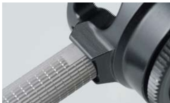
Cutout Slot - fits most sights